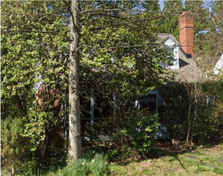
Existing dwelling to be demolished