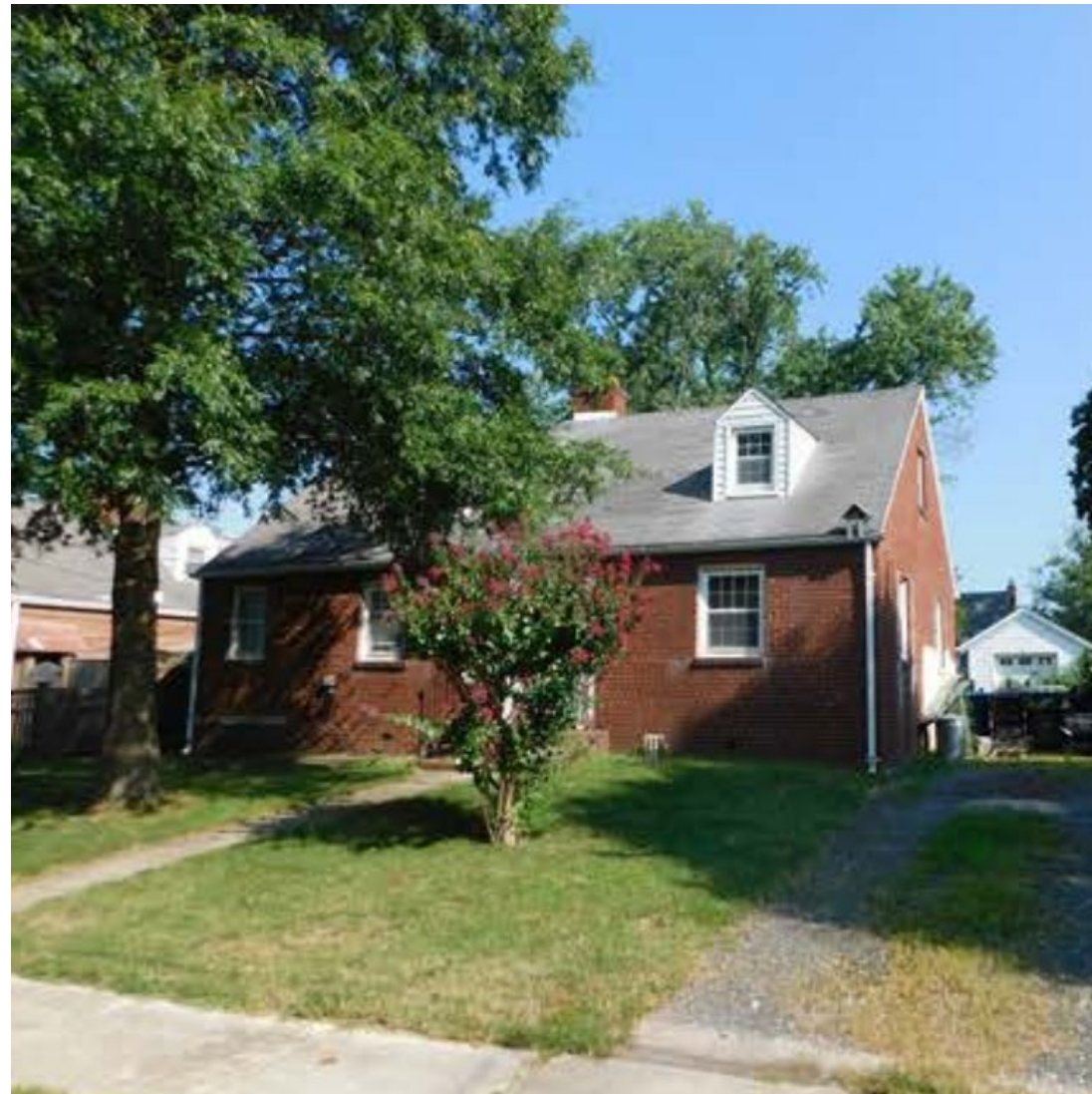
Existing dwelling to be demolished