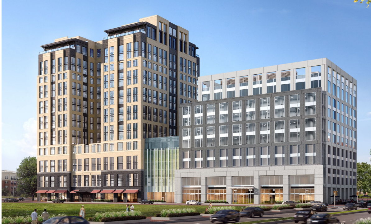
Street view from the Northeast