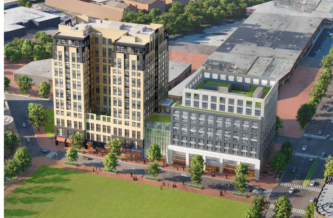
Aerial Perspective –Housing (left) and Office (right)