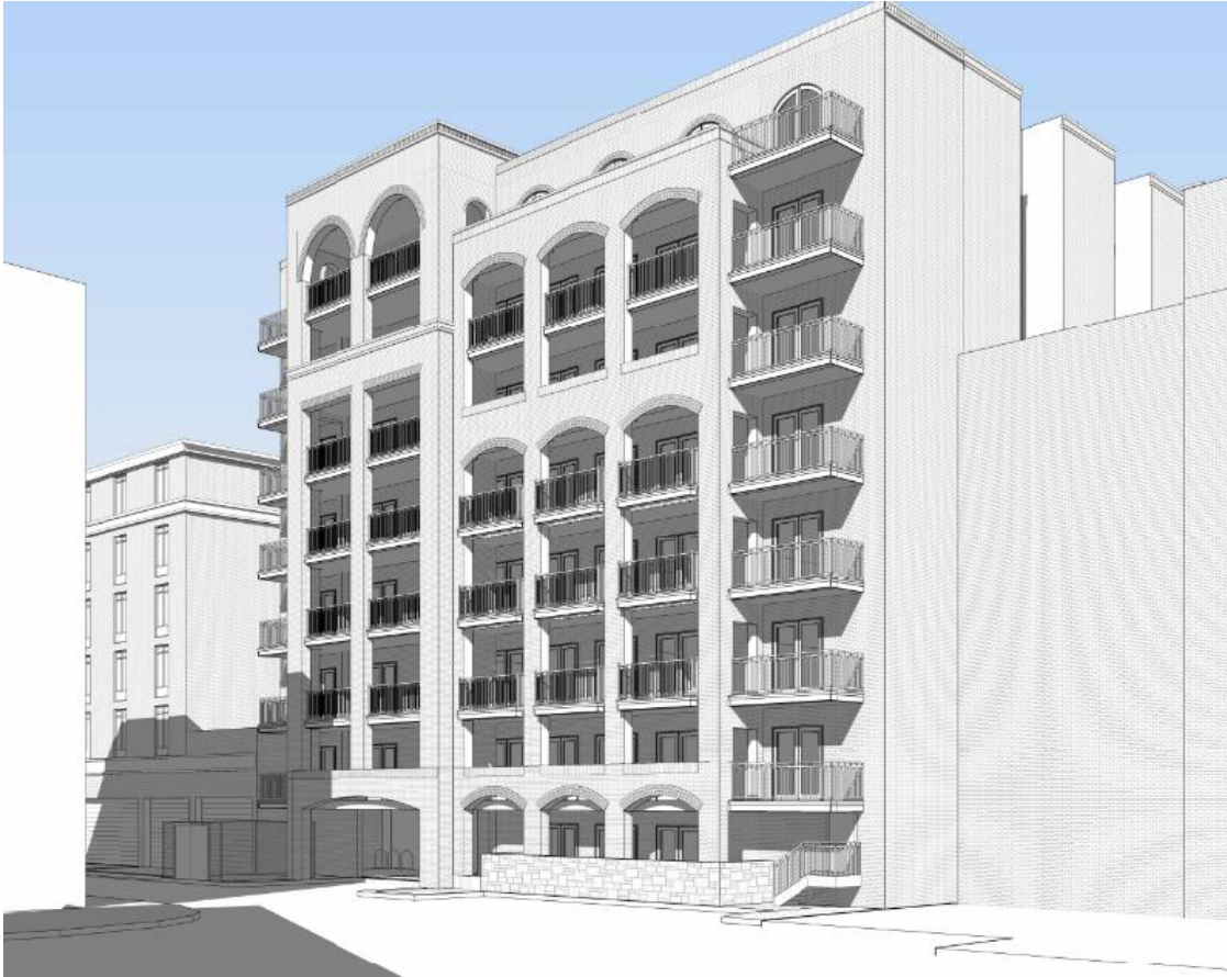
↑ View NW from Dechantal Street