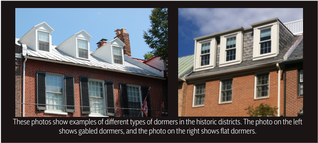
These photos show examples of different types of dormers in the historic districts. The photo on the left shows gabled dormers, and the photo on the right shows flat dormers.

Dormers are windows projecting from the slope of the roof that provide light and ventilation to the top floor of a building. Dormers are particularly visible elements of a roof and can have adverse impacts on a building if not properly designed and sited. If an unacceptable loss of existing historic fabric will result because of the installation of dormers, such installation is not appropriate.