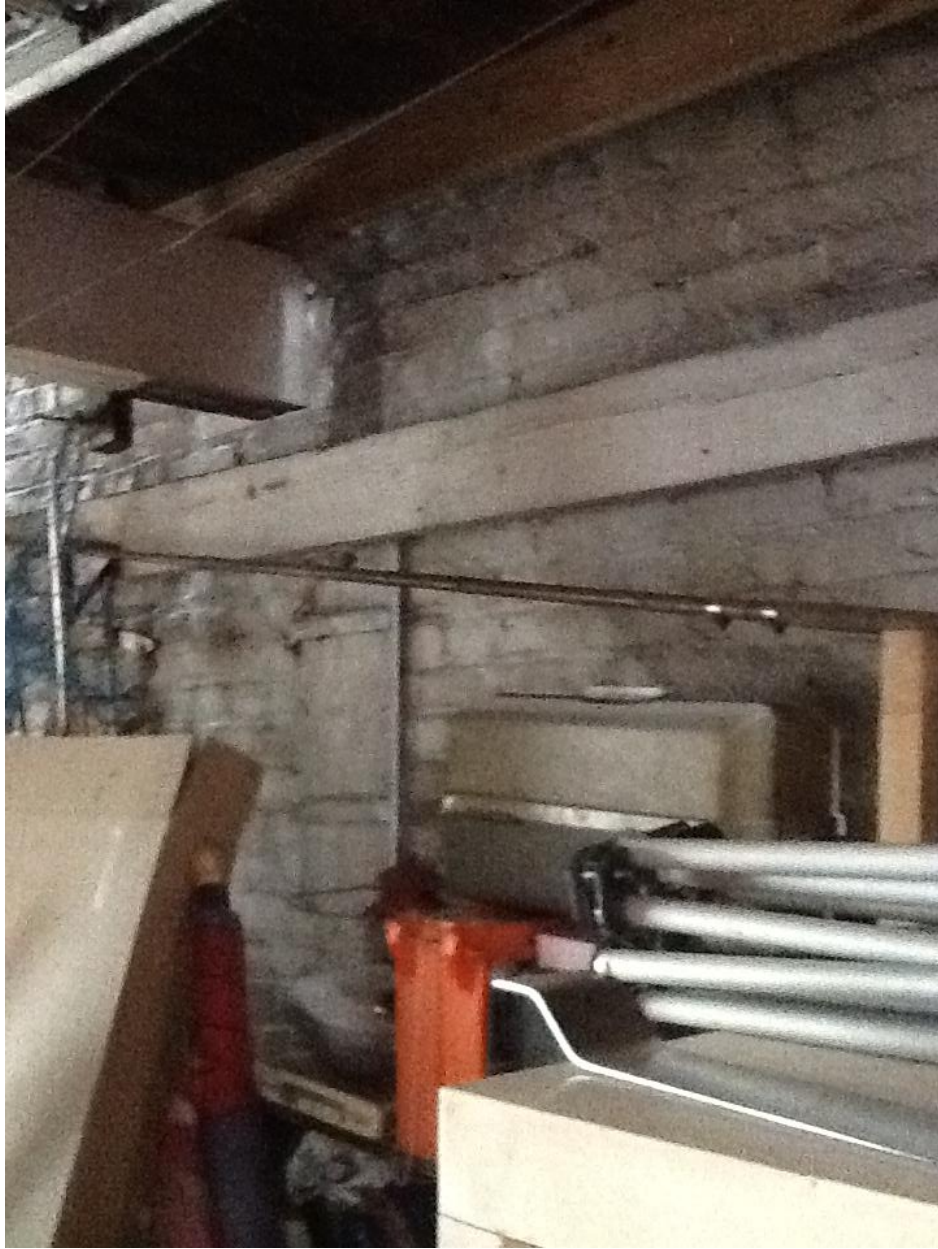
Garage - Inside