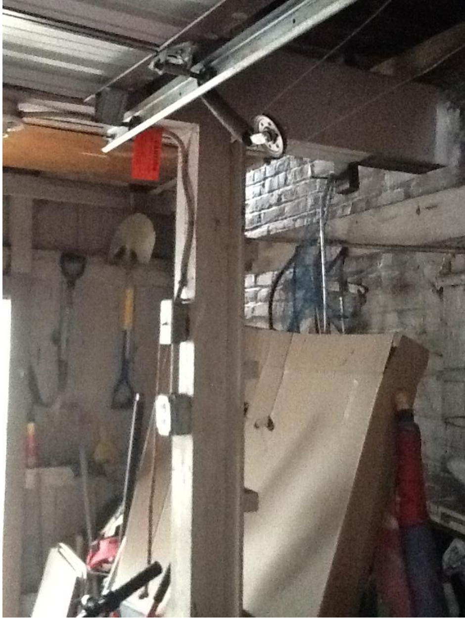
Garage - Inside