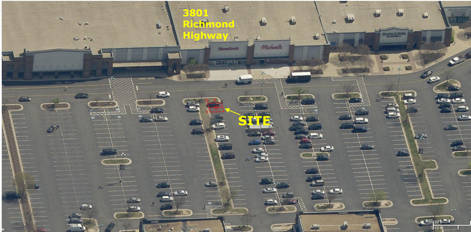
Potomac Yard Shopping Center