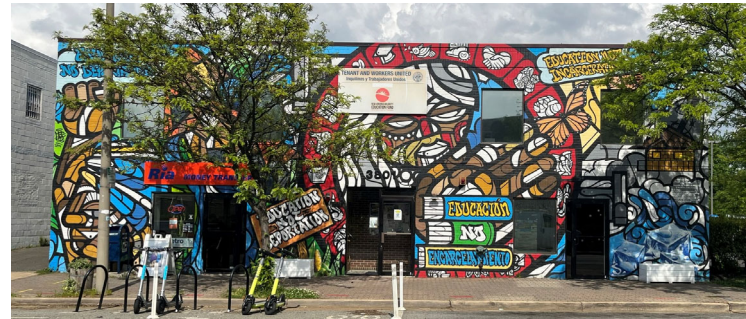
Tenants and Workers United Mural, MasPaz 3801 Mount Vernon Avenue