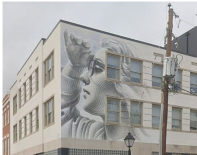
Untitled, El Mac 901 King Street