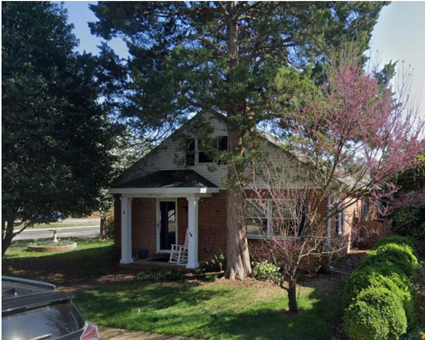
Existing dwelling to be demolished