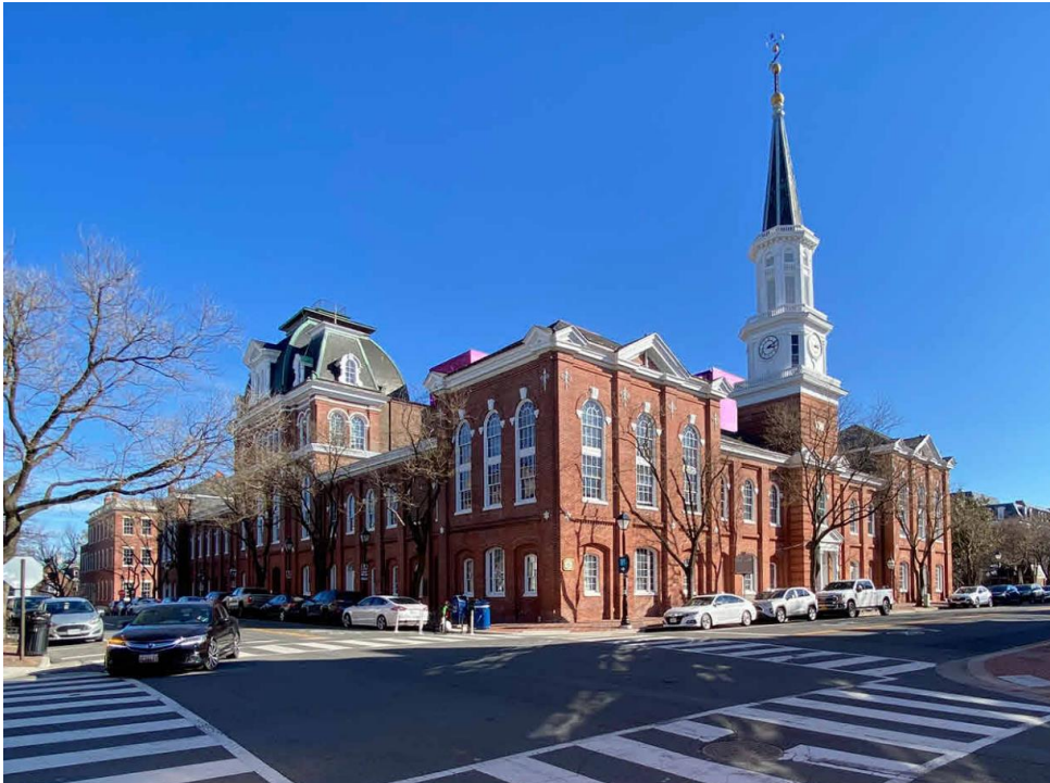
Picture: Current City Hall, as seen from N. Royal St. & Cameron St.

1871 Original City Hall building to be preserved.