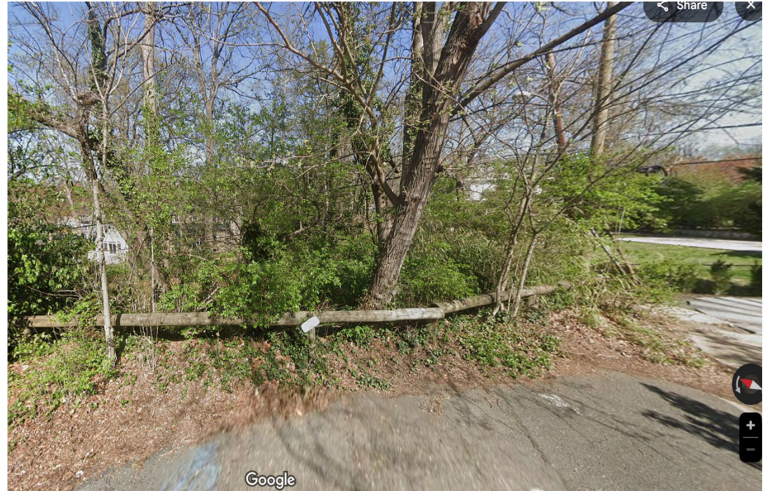
View of the unimproved right-of-way from Kent Place