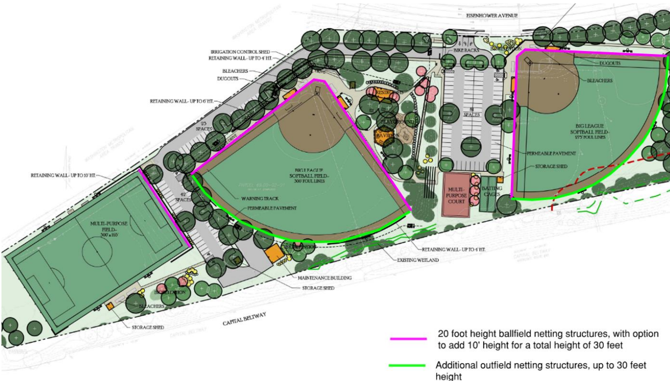
Hensley Park – SUP Request for Netting (Sept. 2022)