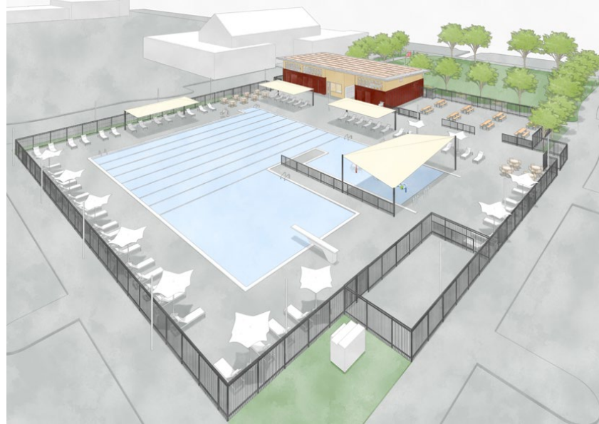
Birds-eye view looking south-east from parking lot