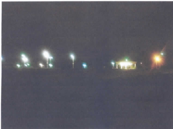
View toward Woods Place and Woods Avenue