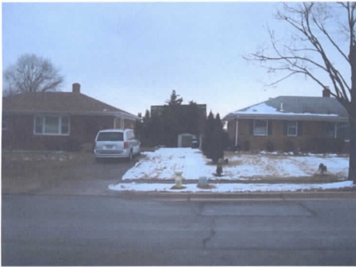
Football Scoreboard from Woods Place