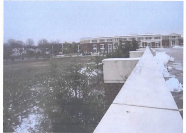
From the parking garage