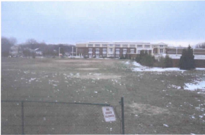
King Street playing field