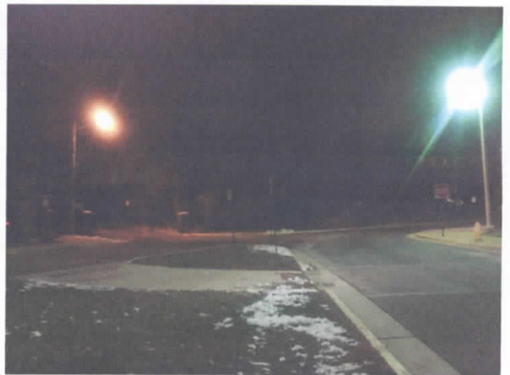
3401 Woods Avenue is across from stairs