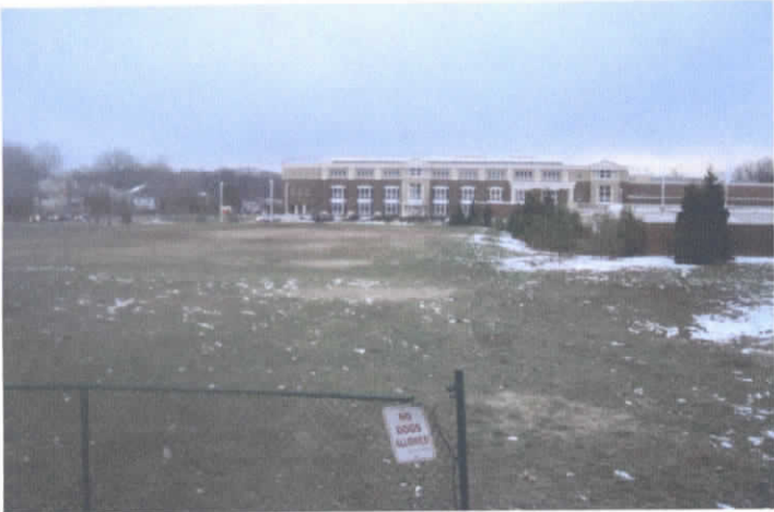
King Street playing field