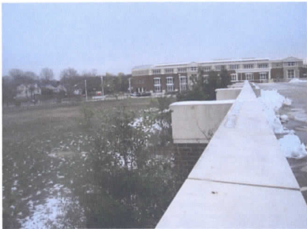
From the parking garage