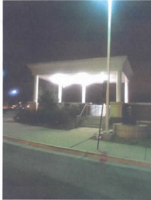
Stairs shine on Woods Avenue