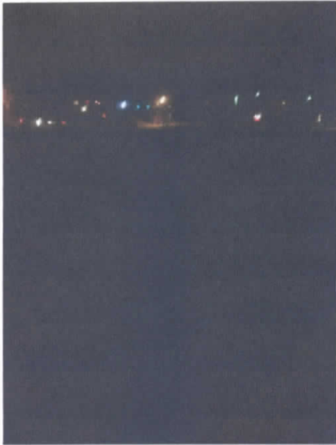
View toward King Street