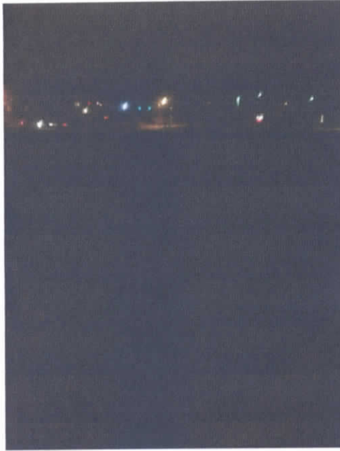
View toward King Street