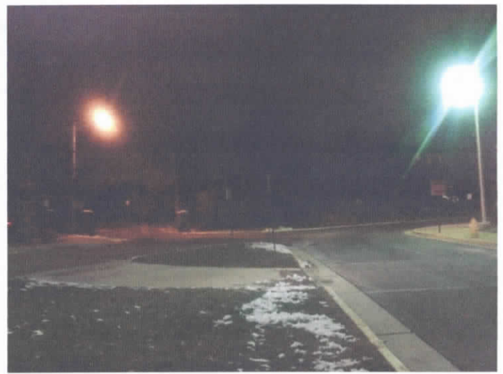
3401 Woods Avenue is across from stairs