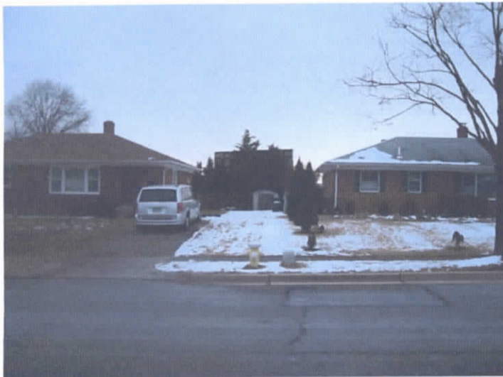
Football Scoreboard from Woods Place