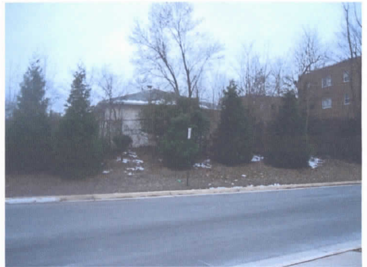
3401 Woods Avenue