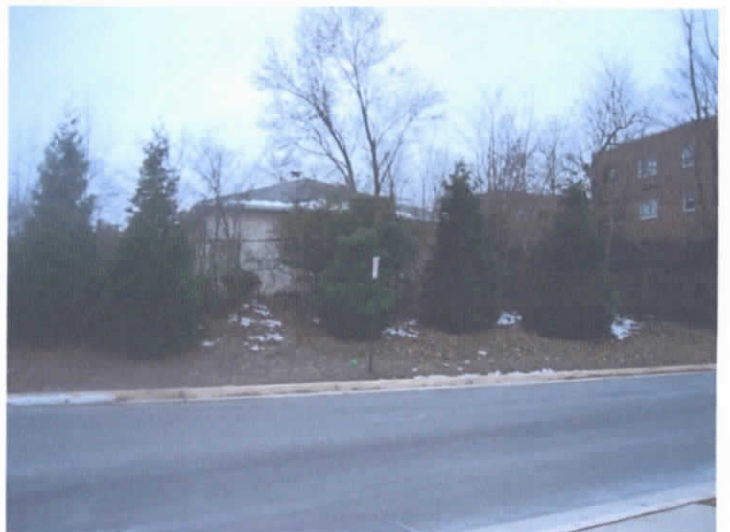
3401 Woods Avenue