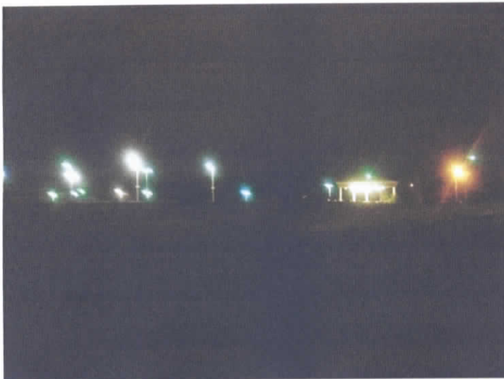
View toward Woods Place and Woods Avenue