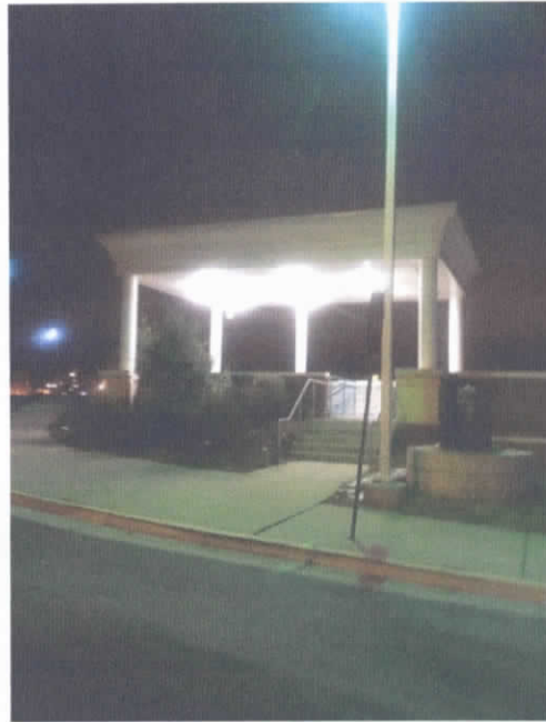
Stairs shine on Woods Avenue