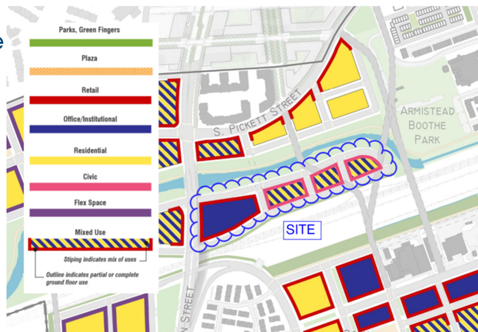
Eisenhower West SAP future land use map