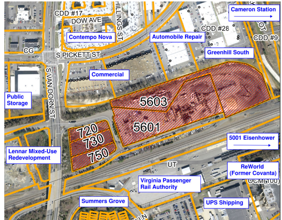
Map of surrounding uses