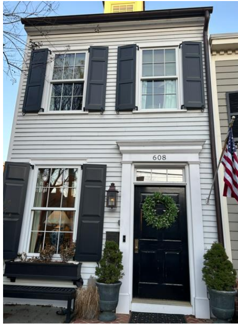
Figure 1: View of subject property showing existing 6-panel door.

The Board approved a Permit to Demolish for the demolition of a small 20 th -century vernacular dwelling on this property on December 16, 2015 (BAR Case #2015-0358). The Board approved a Certificate of Appropriateness on January 20, 2016 (BAR Case#2015-0359) for new construction. The house was constructed in a Federal Revival style. In October 2025, staff administratively approved an application to replace the front door with a new 6-panel solid wood door with the top two panels being glass.