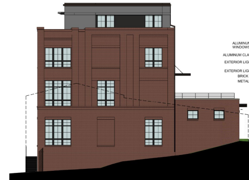
Interior end unit elevation

ALUMINUM CL. WINDOWS ALUMINUM CLAD W. EXTERIOR LIGHTN. EXTERIOR LIGHTN. BRICK HEA METAL AW