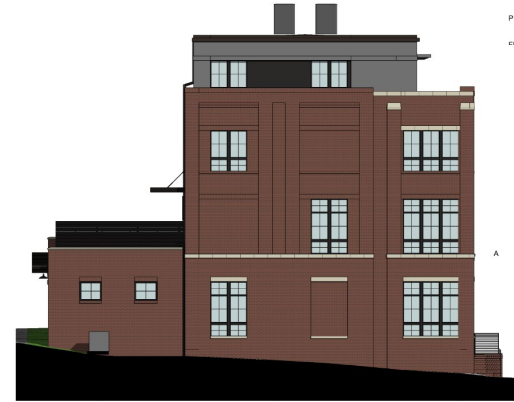
Duke St. elevation