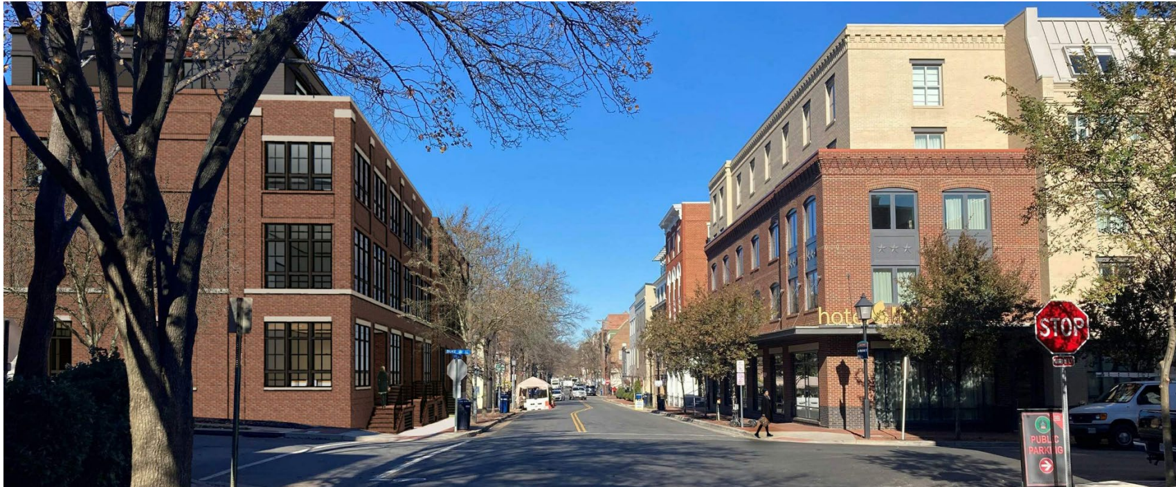
Illustrative rendering of proposed project

Staff and Planning Commission recommend approval, as amended (Condition #8a).