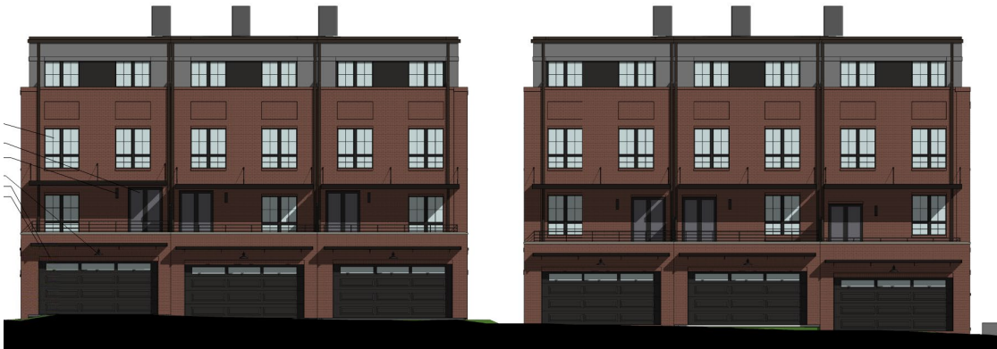
Private alley elevation