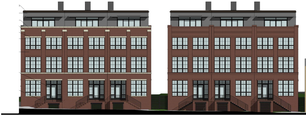
South Union St. elevation

S. Union St. Townhouses - DSUP#2021-10012