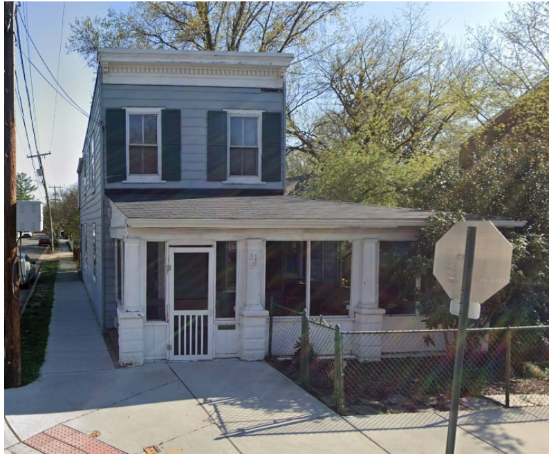
Existing dwelling to be demolished