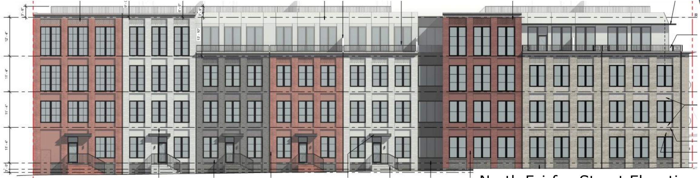
North Fairfax Street Elevation