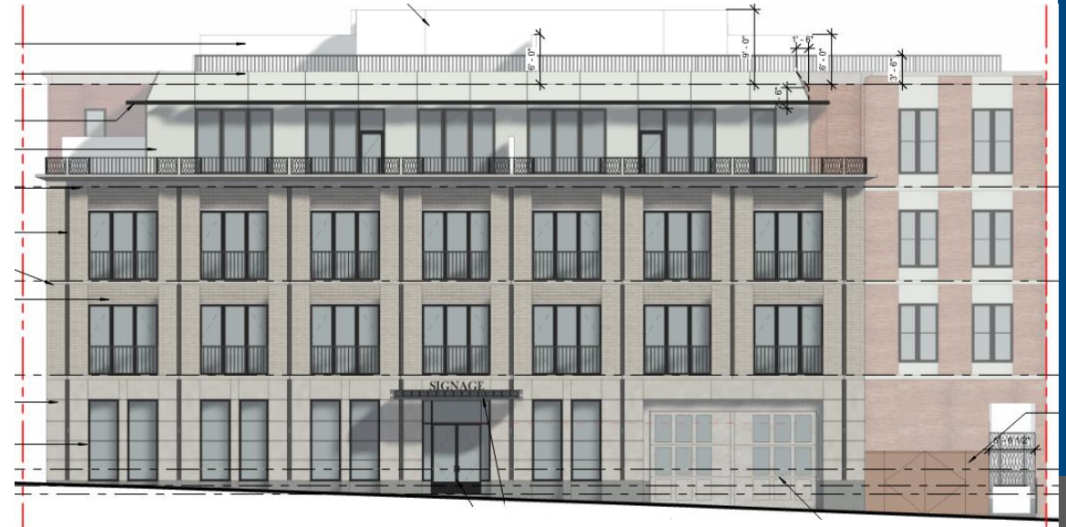
Queen Street Elevation