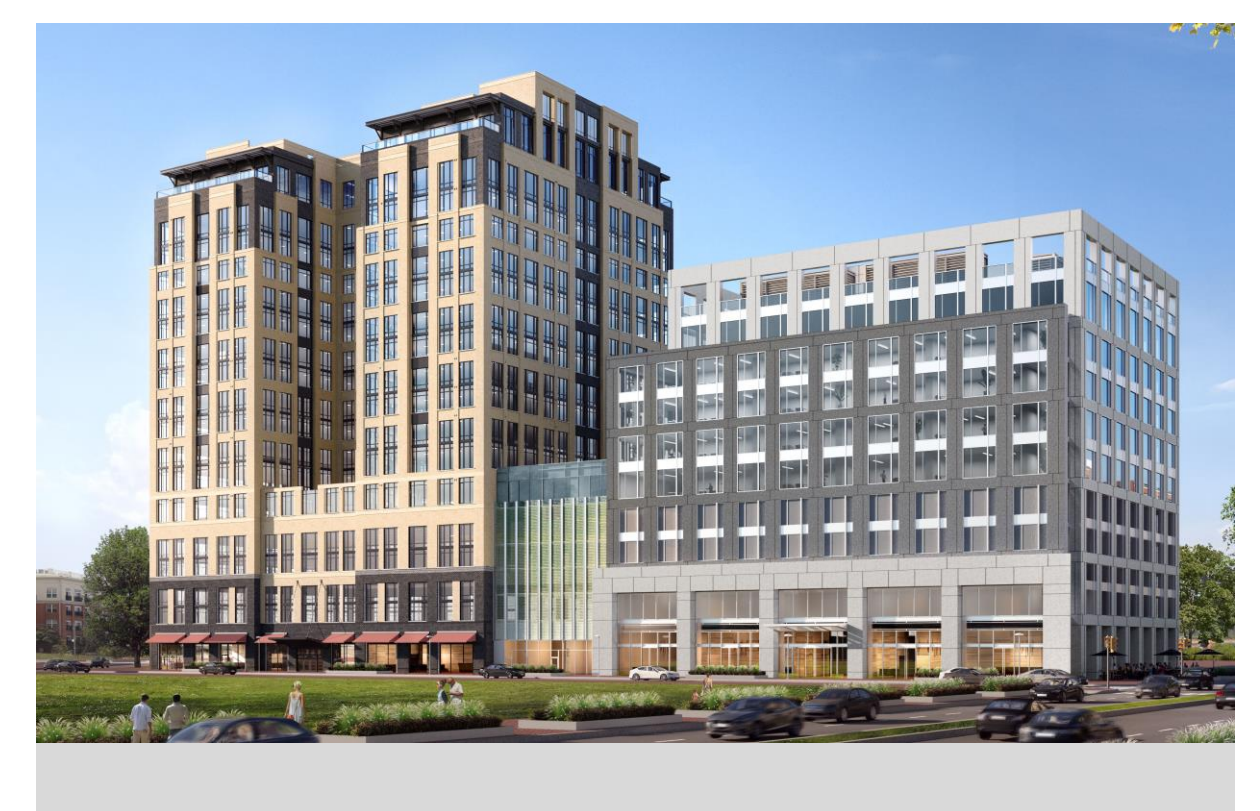
Street view from the Northeast