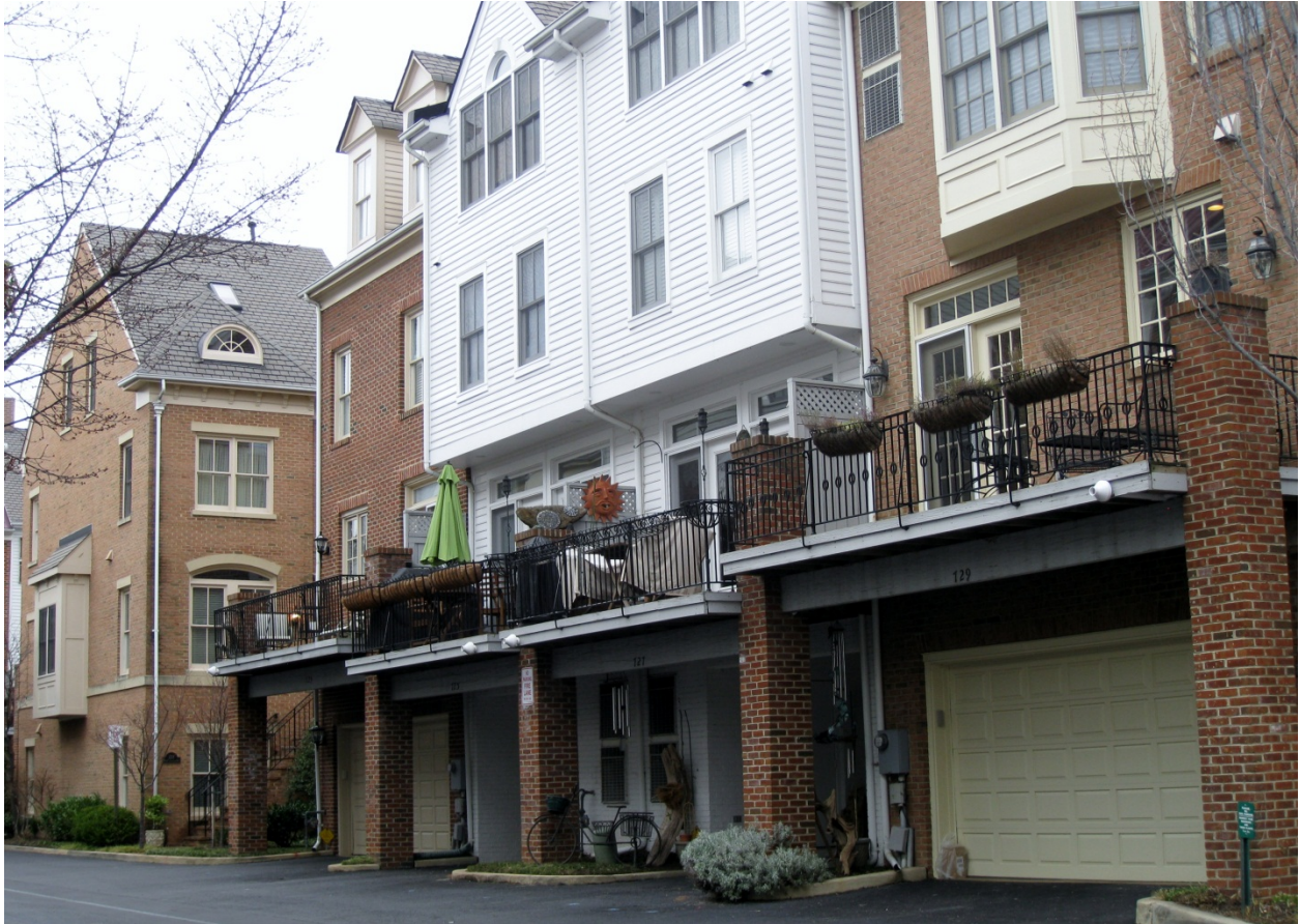
Figure 10: Category V houses.