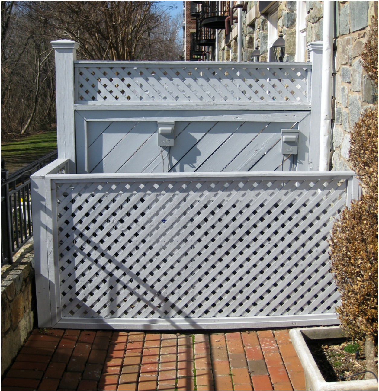
Figure 4: Previously approved installation and prototype for Category III houses.