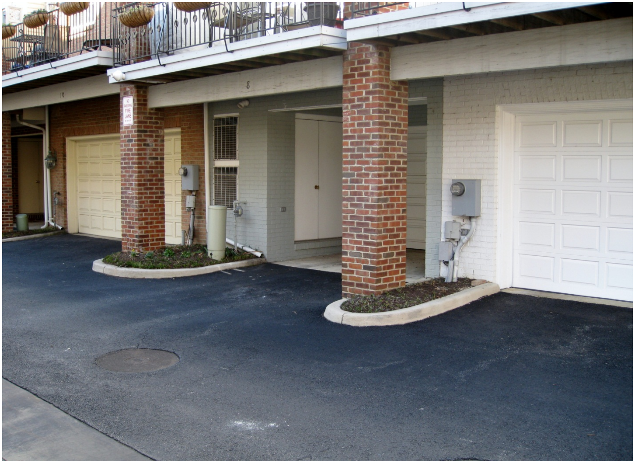
Figure 8: Areas at rear of Category V houses where exterior unit might be placed.