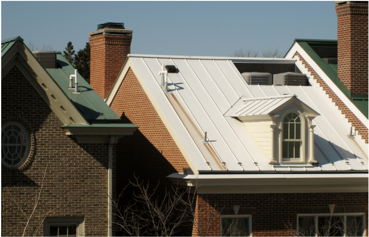
Figure 1: Typical South Union Street house with exterior units in roof cutout.