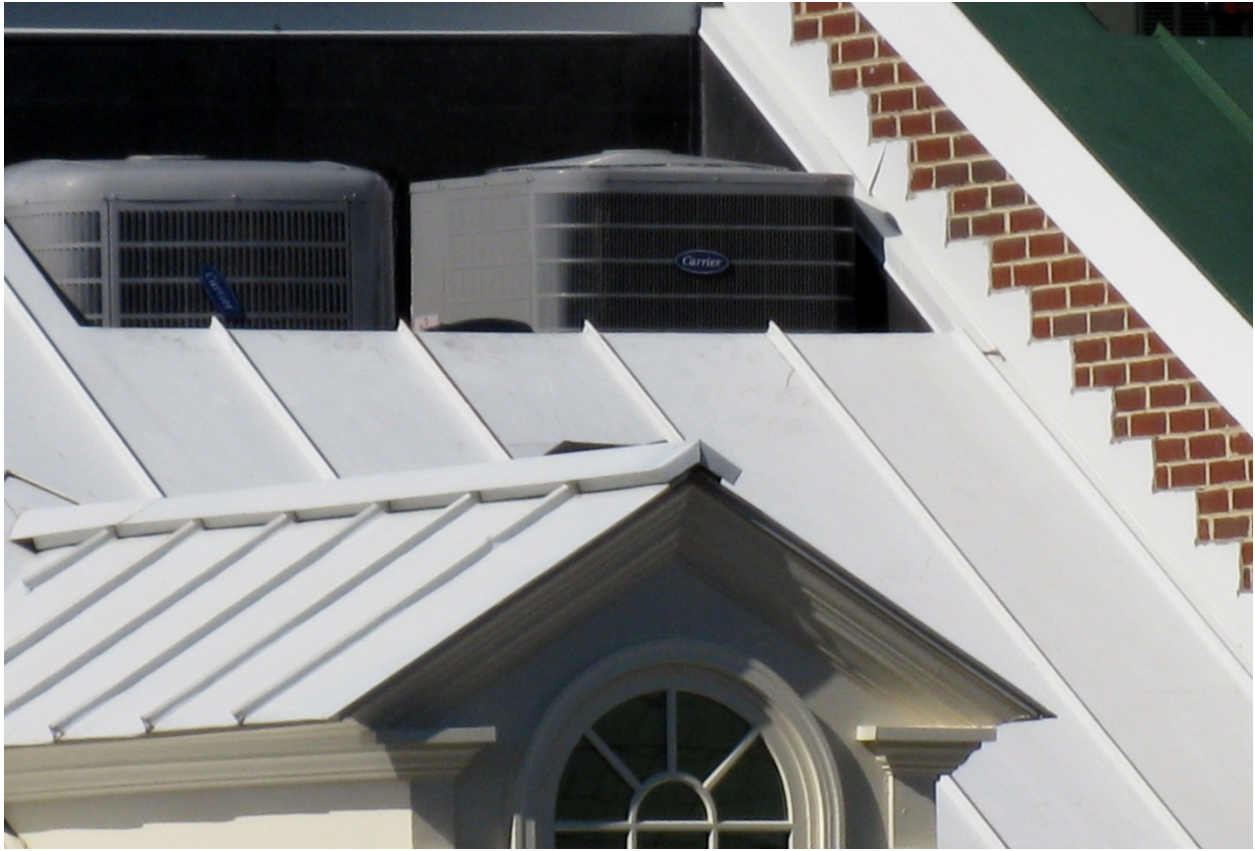
Figure 7: Roof cut-out installation.