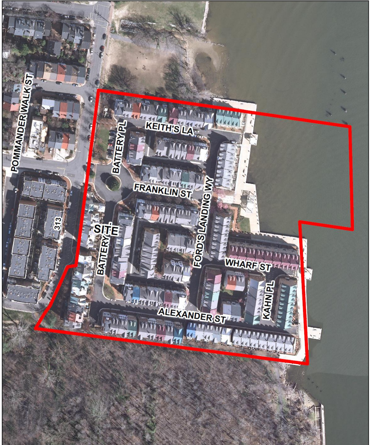
CASE BAR2013-0049 & CASE BAR2013-0050