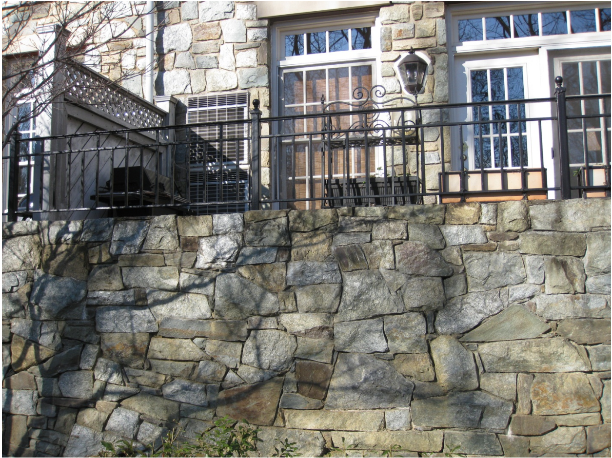
Figure 5: Exterior of Category III house showing existing through-the-wall units.