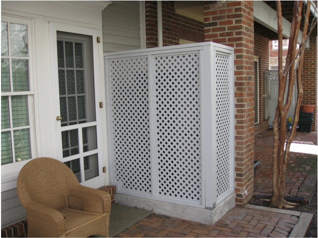
Figure 6: Previously approved installation and prototype for Category IV houses.