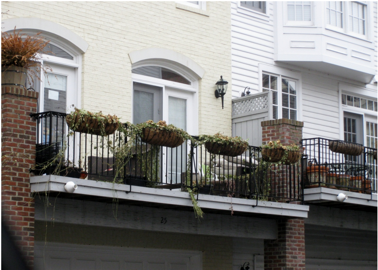
Figure 9: Deck of Category V house.