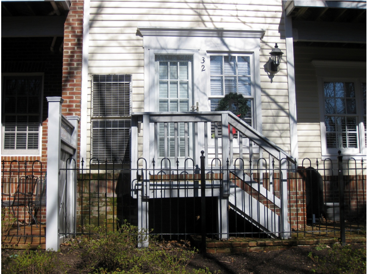
Figure 3: Typical Category II house on Alexander Street. Exterior units to be installed on extended stoop or concrete slab in front of existing units.