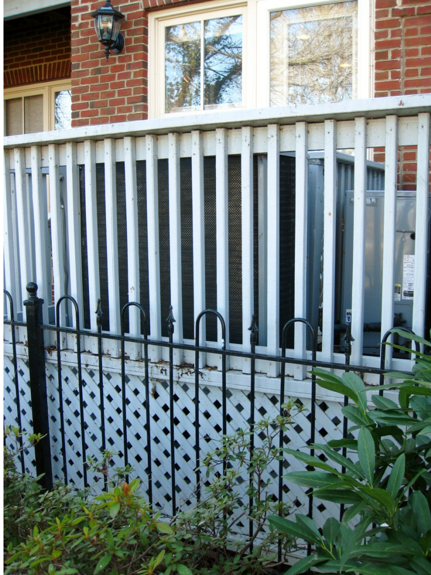
Figure 2: Previously approved installation on Keith's Lane showing expanded deck, railings and lattice.