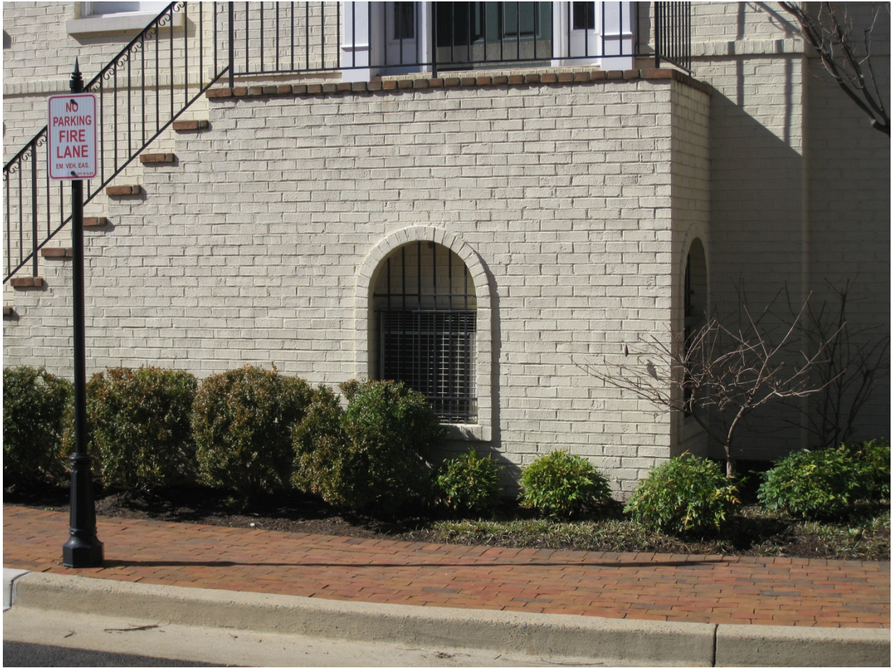
Figure 12: Typical Category VII location for placement of units under steps with infill to be removed.