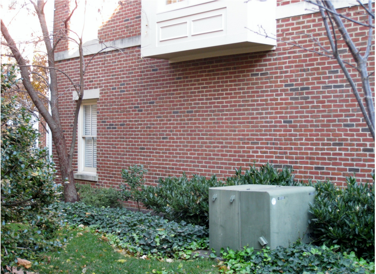
Figure 11: Category VI – Ground level installation below bay window.