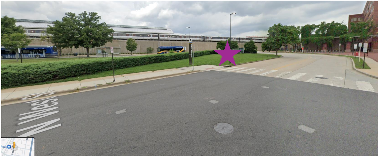
Street View showing potential locations