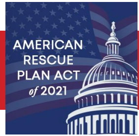
Spending by Category Projects Recommended for Funding