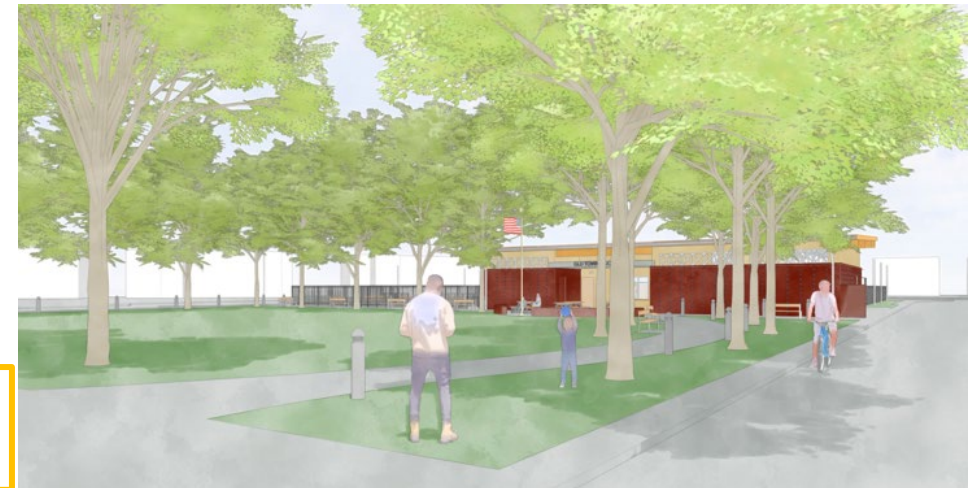
Street view looking north-west from Cameron Street