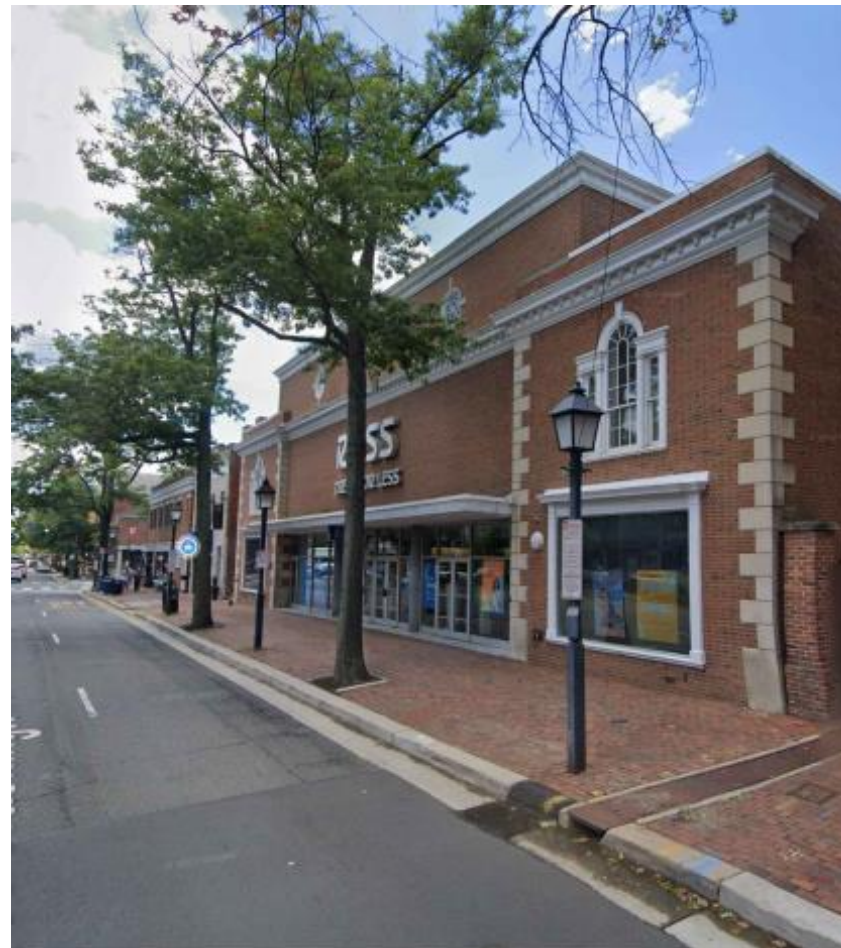
View from North Washington Street