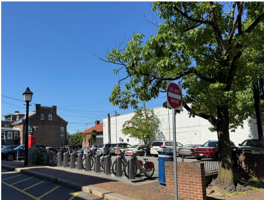
Figure 3: 916 and 920 King Street, Looking SW