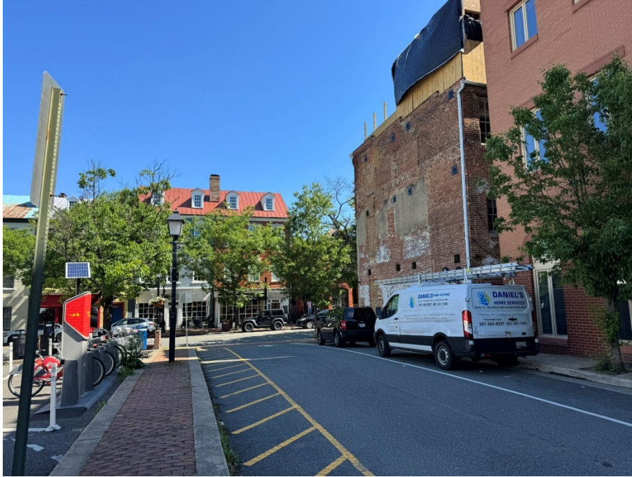
Figure 2: 912 King Street, Looking NE