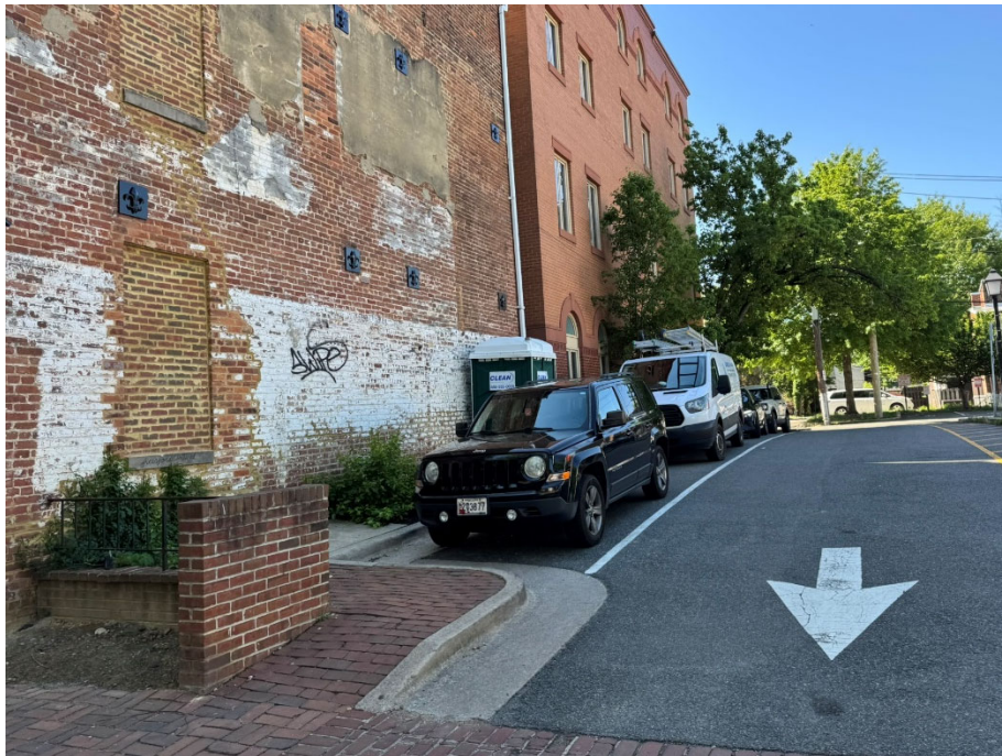
Figure 1: 912 King Street, Looking SE

The property is located directly behind 102 S. Patrick Street and adjacent to other shops and restaurants east and west on King Street. The parcel is improved with four asphalt-paved parallel parking spaces. These spaces are a portion of the larger 18 parking space City-owned, public, metered surface parking lot. The parcel at 912 King Street is zoned KR – King Street Urban Retail Zone (Parcel ID #074.01-06-04) and is within the Old and Historic Alexandria District. The adjacent improved and developed parcels (910, 916, and 920 King Street) are also zoned KR– King Street Urban Retail.