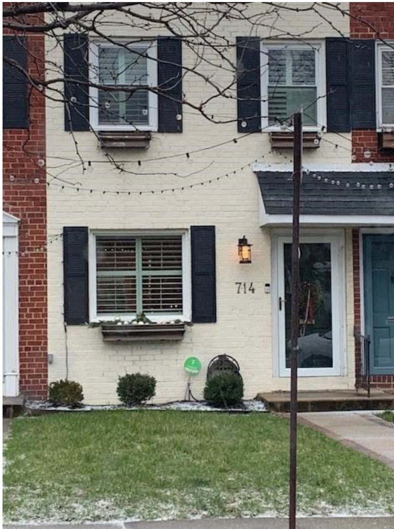
Figure 1: 714 South Alfred Street

Per the Design Guidelines , windows are a principal character defining feature of a building and the size, location, type, and trim of windows are defining elements of historic architectural styles. As originally constructed, the steel casement windows set flush with the wall surface in the unadorned punched openings of the Patrick Henry Homes expressed ideals drawn from the International Style. The windows retain their character-defining punched openings, size, location, and lack of window trim. The only change is the type of window. Like almost every house in the development, this one no longer has steel casements. The current simple one-over-one pattern of the upstairs windows and the single-pane on the first level fit in well with the original minimalist and unadorned design. The interior shutters give the impression of window muntins. See Figure 1. Staff notes that the Board approved one-over-one second-level windows at 712 North Alfred Street, next door, at the April 7, 2021 hearing.