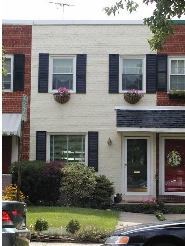
Figure 2: 714 S. Alfred in VDHR 2005 reconnaissance photo

Staff would like to point out that upon receipt of the complaint regarding these windows, we requested the window specifications from the owner. The owner was unable to locate those specifications from previous owners. The complainant indicated that he/she has photographic evidence that this property had its original steel casement windows as late as 1979, but by 1987 the current windows were in place. If the complainant is correct, the current windows have been in place for over thirty years. Staff could not locate photos that old, but a 2005 Virginia Department of Historic Resources 2005 reconnaissance survey depicts these windows. See Figure 2.