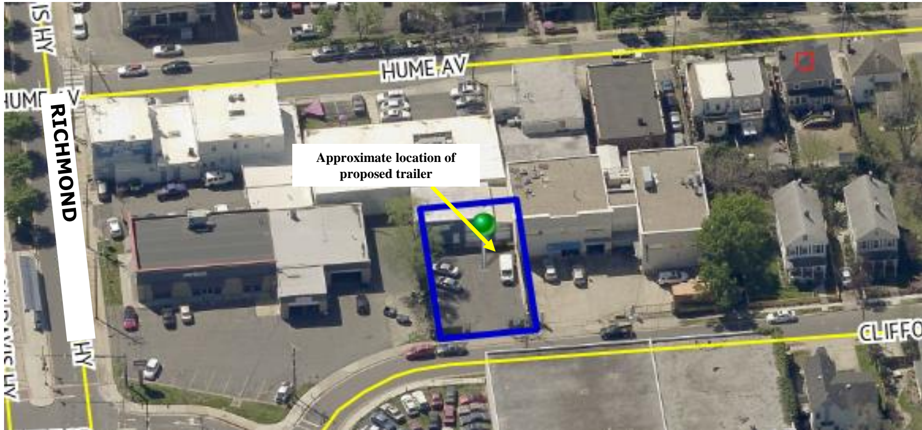
Site Context with Nearby Residential from the north side of Clifford Avenue