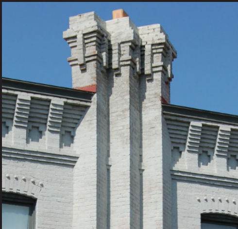
The corbelled brick chimney is a character-defining feature of this Queen Anne-style residence.