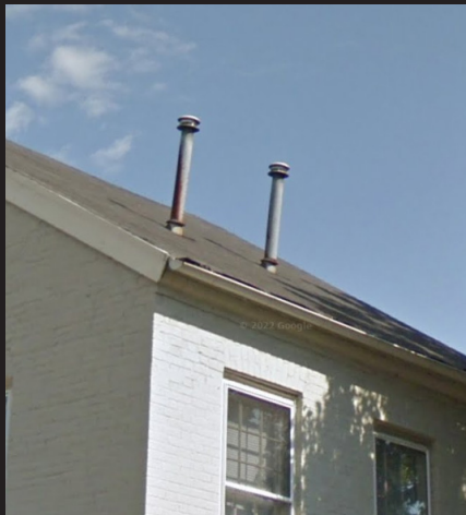
Example of an inappropriate exterior metal flue chimney on a historic building.