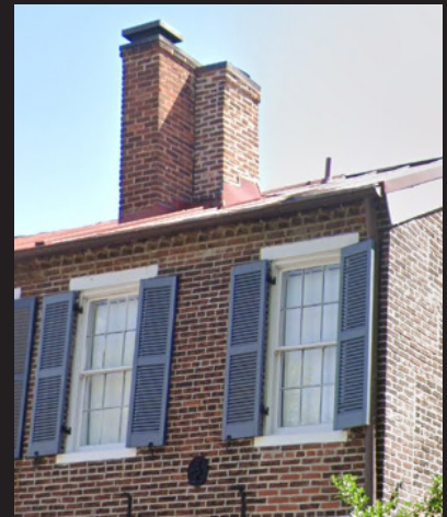
Example of brick chimneys commonly found on historic Old Town residences.