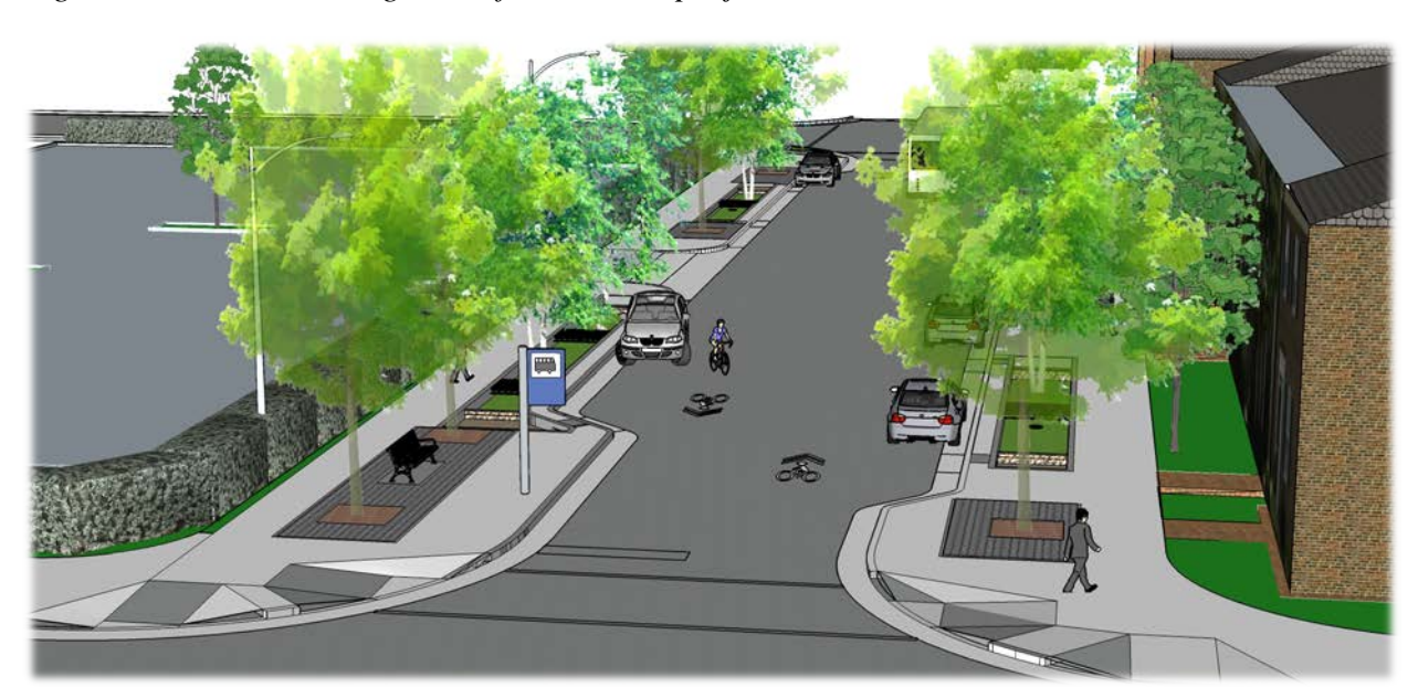
Figure 3 – Second Street green infrastructure project