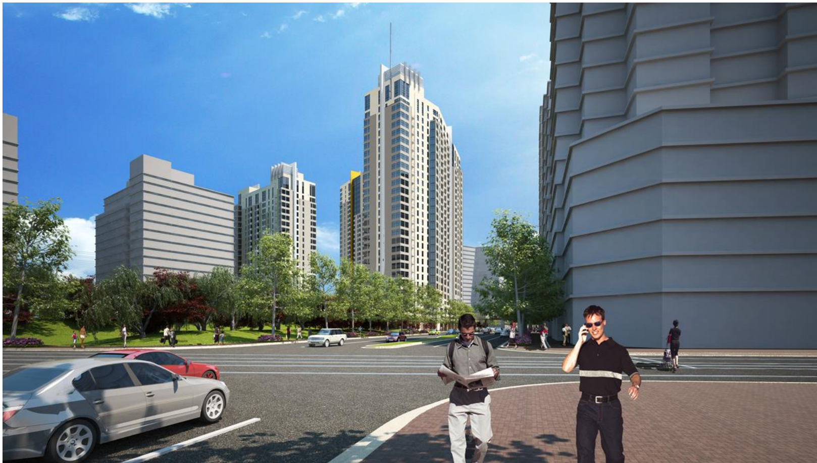
Street view of Blocks 11 & 12 from Eisenhower Ave.