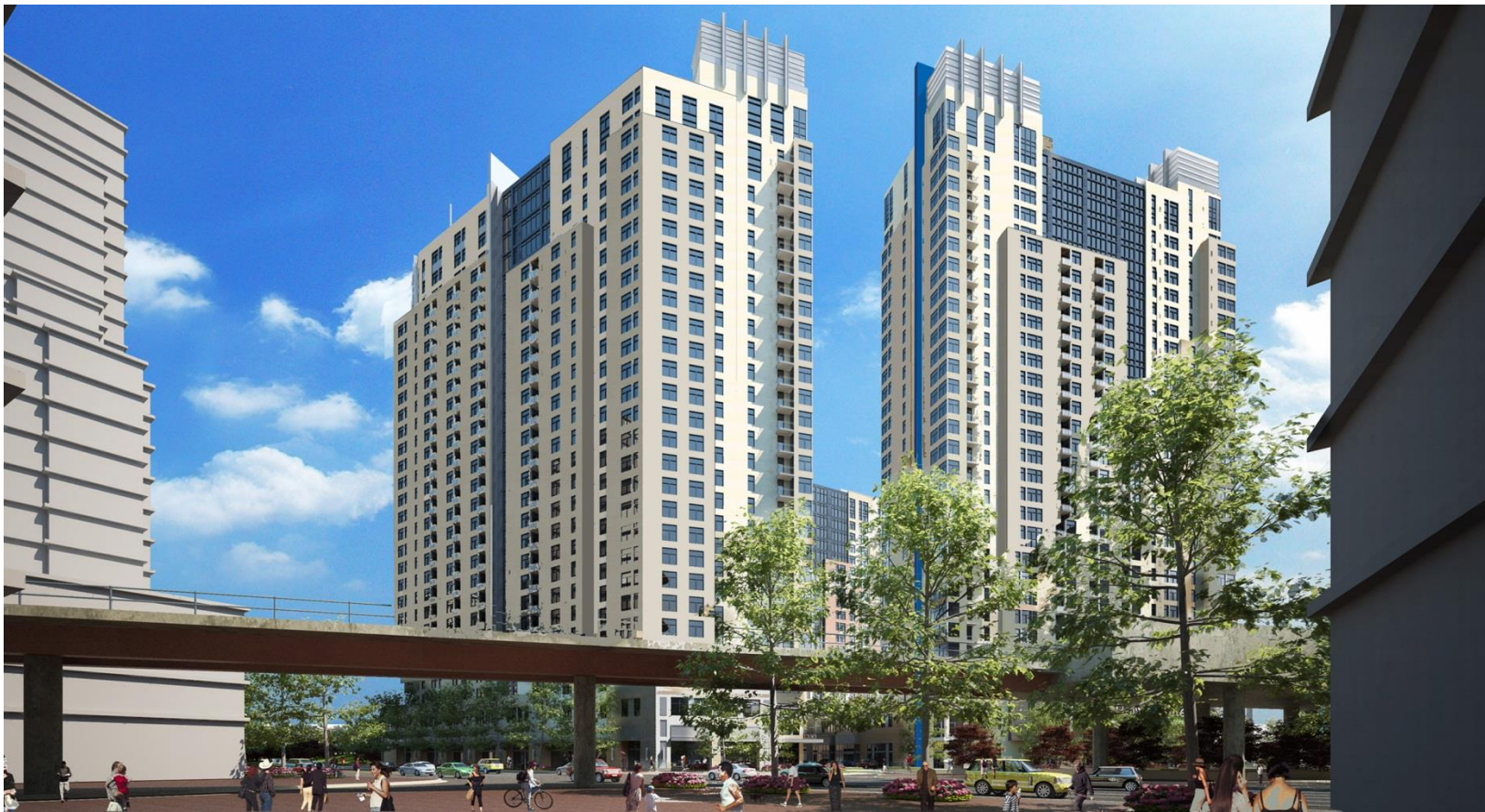
Street view of Blocks 11 & 12 from Eisenhower Avenue Metro Station