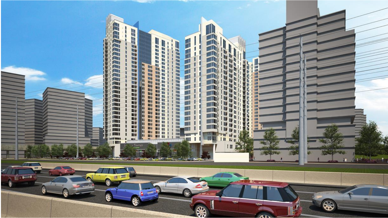
View from the Capital Beltway